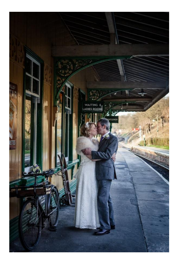
You can hire Oberon Station for your Vintage Wedding Photo.