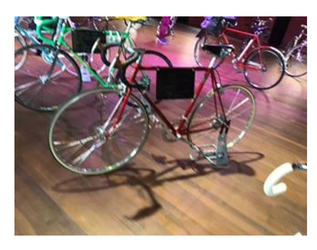
One of over 400 bikes in the collection

The display drew a crowd of over 250 spectators. A couple of bikes from their immaculate display are pictured below.