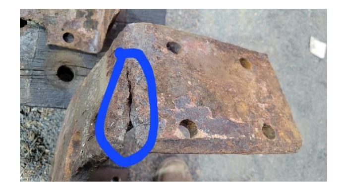
Some work to do here. A bit like restoring a car, only bigger!

One of the delicate tools used to dismantle headstocks.