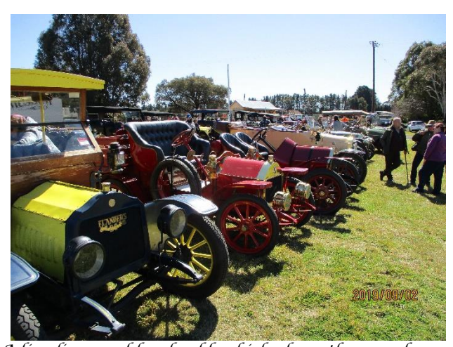
A fine line up of lovely old vehicles from the era when the Oberon Branch Line was opened in 1923.

We haven't settled the cost of this event yet. Mayfield Garden will be handling all ticketing and catering on our behalf for this event. Further advice to come.