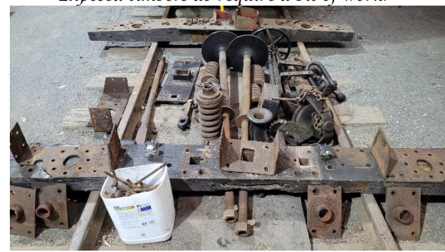
Metal rails and bibs and bobs removed for some restoration work.