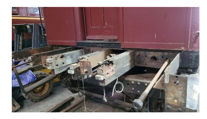
Exposed timbers do require a bit of work.

Meanwhile, administration work is also huge for our railway and regulations must be rewritten and updated, so a lot of particularly important work was also performed on our Safety Management System documentation.