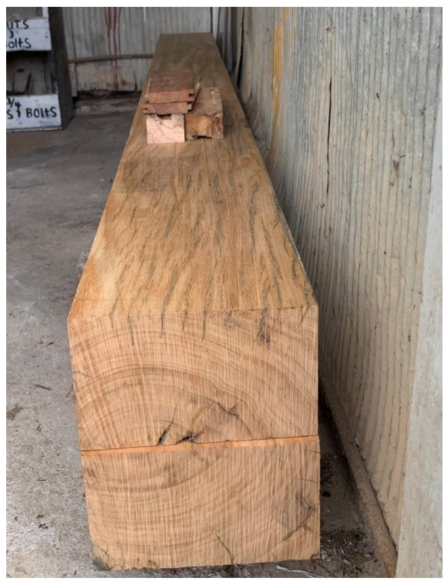
New Headstocks for HS36

Admission $5 (18 and over), Oberon District Museum admission $5. Skoda Tatra Museum entry by way of a donation. For group visits: see <a href="http://othr.com.au">http://othr.com.au</a> (contact us) or contact President Greg