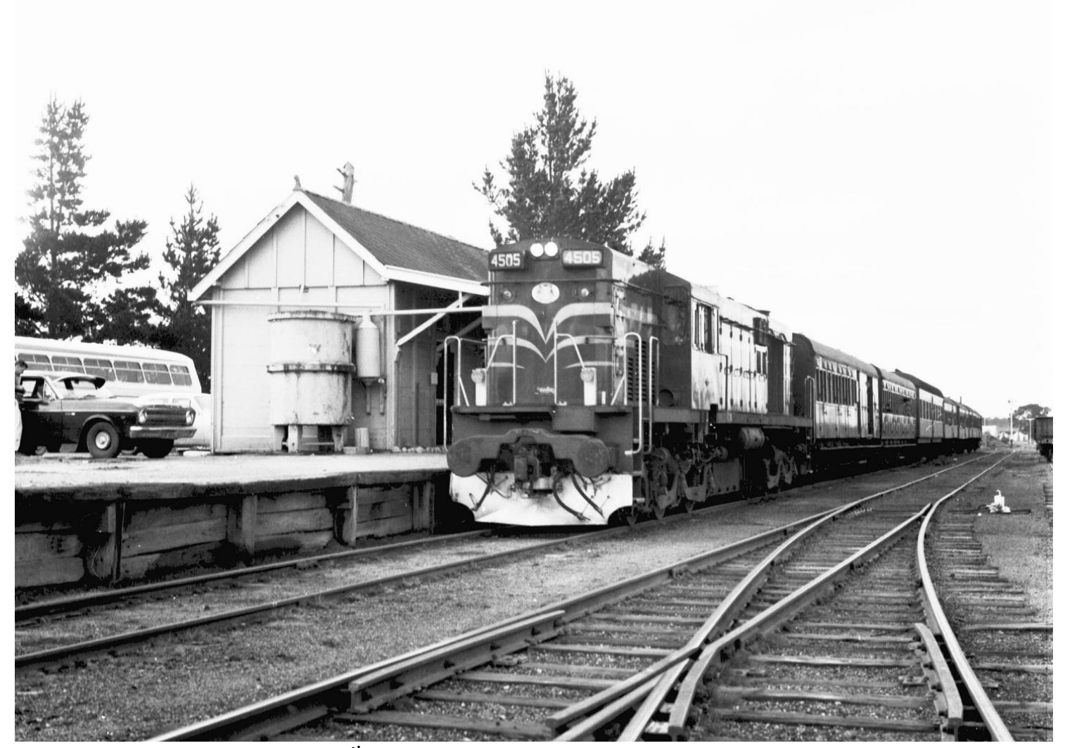
As we head towards the 100<sup>th</sup> anniversary of the Tarana to Oberon branch line, Let's glance at our past for just a moment.