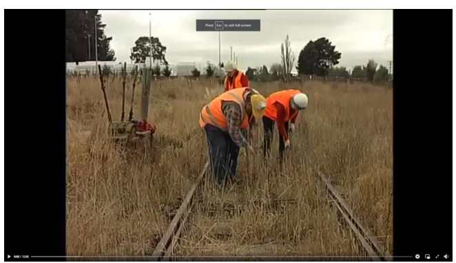
First working bee - knee high weeds See page 9 for a May 2023 photo

Network with other rail heritage groups and museums at Valley Heights, Lithgow, Zig Zag, Bathurst, and Cowra to form a Heritage Railway partnership to prioritise and promote the area as a Railway Tourist Precinct