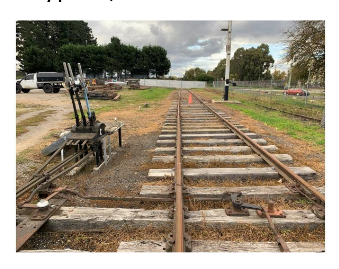
Referral from page 3 2023 photo taken from almost the same spot