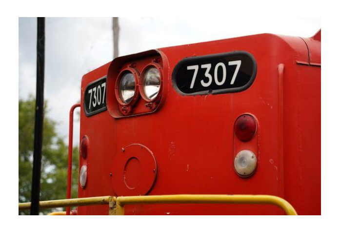
A unique photo of OTHR Locomotive 7307