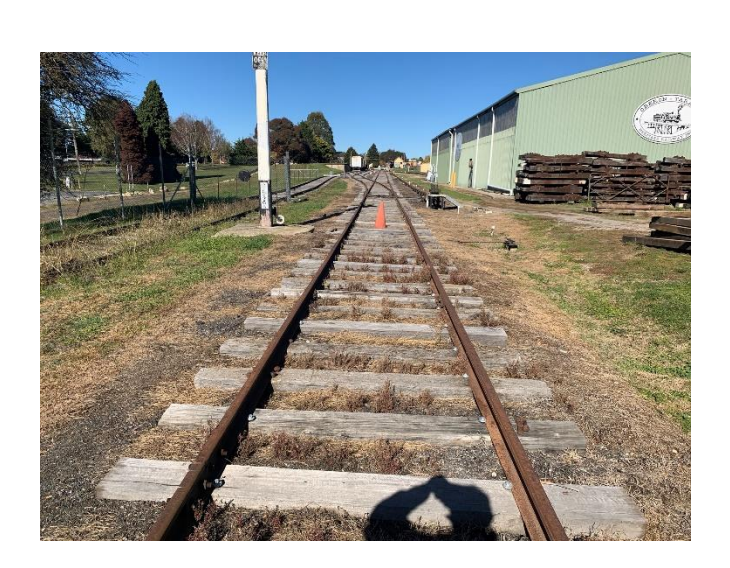
This photo taken in May 2023 - Result of a tremendous amount of work by volunteers.