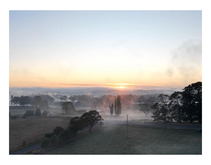
Autumn around Shooters Hill. NSW, a short drive from Oberon.

Early misty mornings are the best and to meander along any of Oberon pathways is an absolute delight.