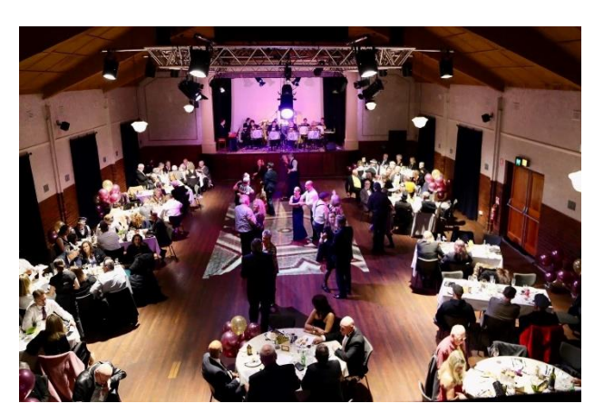
Be a part of The Great Railway Ball. Tickets will be snapped up quickly.

Be entertained by a big band at The Great Railway Ball 2023