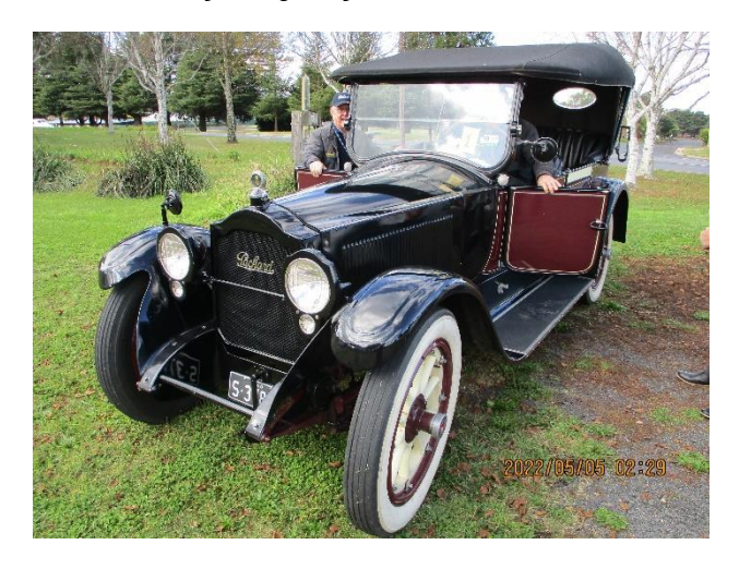
Put your classic in the picture at the re-enactment of the opening of the Oberon Branch line.