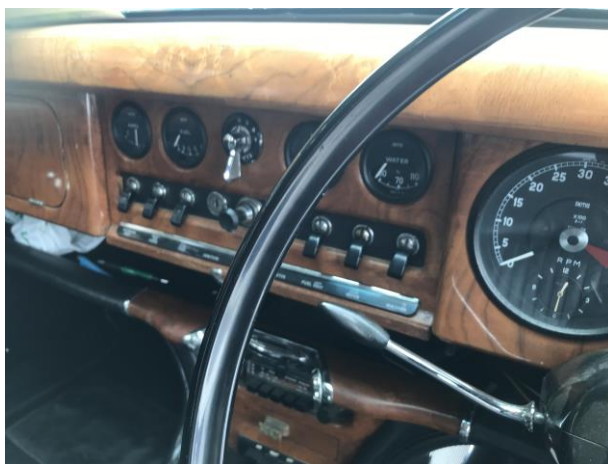
Photo of 1963 3.8 Jaguar S type dashboard, owned by Deb Creed of Armidale