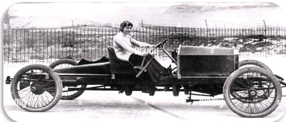
Dorothy Levitt at the controls of a 26hp Napier in 1908