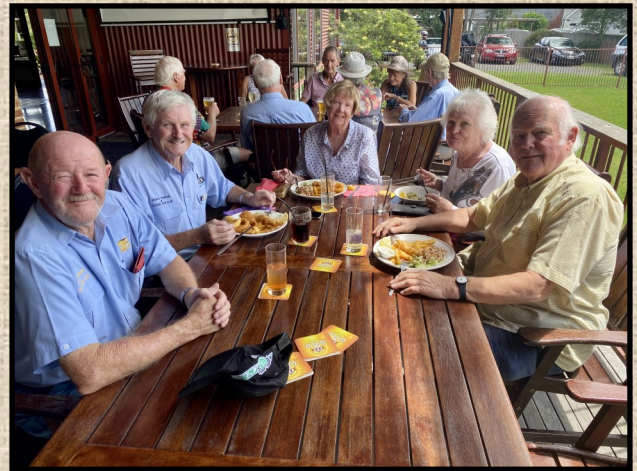
Picturesque views from the balcony of Rosie's Bistro. Plentiful servings ,Superbly cooked.