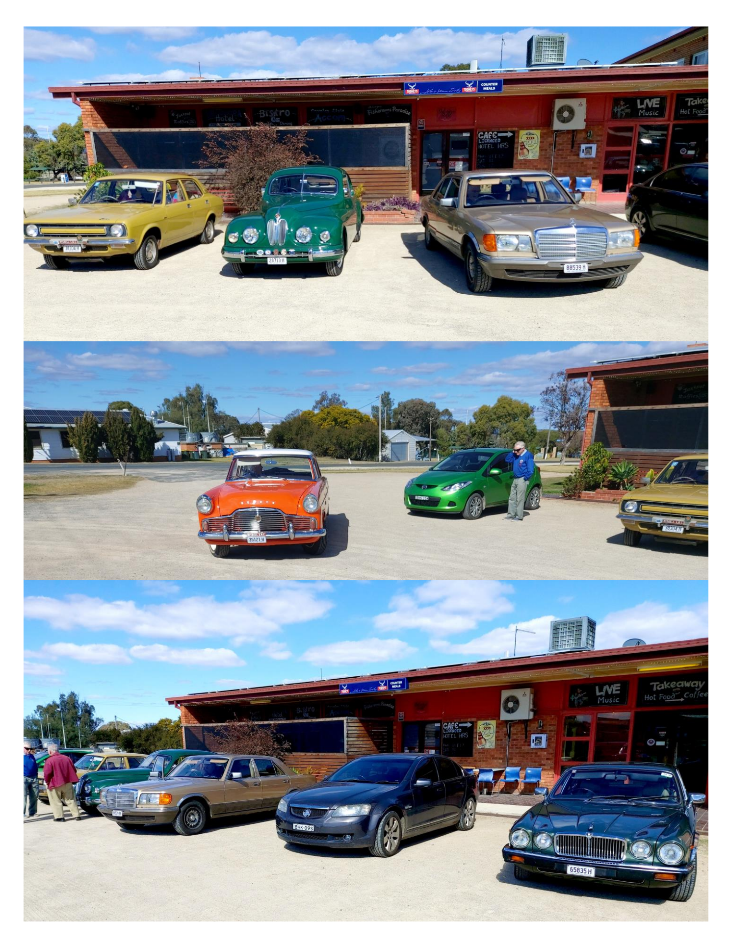
Wednesday Wanders - Delungra