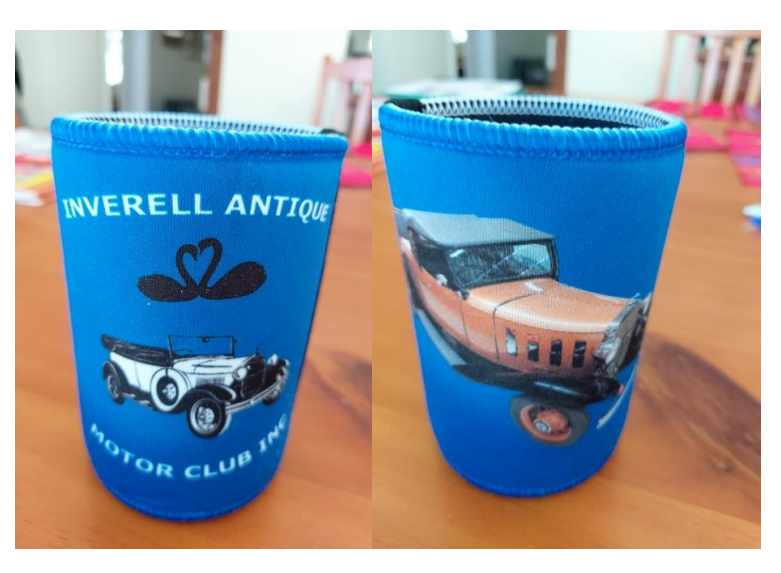
Both sides of stubby holder pictured