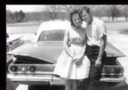
"That's my old Impala!"