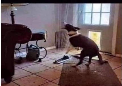
So our dog just brought the sprinkler in through his doggy-door. How's your day going?

If you can't look back at your younger self and realize that you were an idiot, you are probably still an idiot.