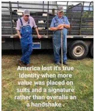
America lost its true identity when more value was placed on suits and a signature rather than overalls and a handshake

Some people don't understand that sitting in your own house in peace, eating snacks and minding your own business is priceless.