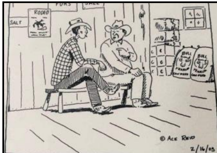
"Anybody that can do at 65 what he was doin' at 25 wasn't doin much at 25!"