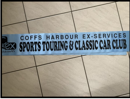
Windscreen Sash $15