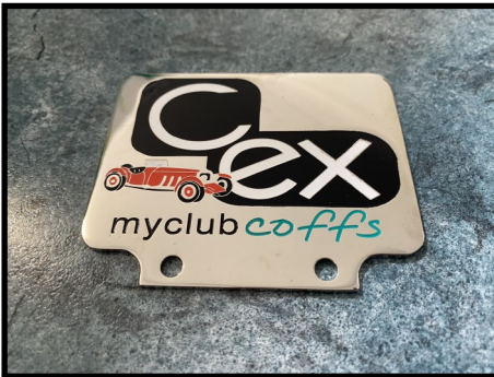
Metal Car Badge $15