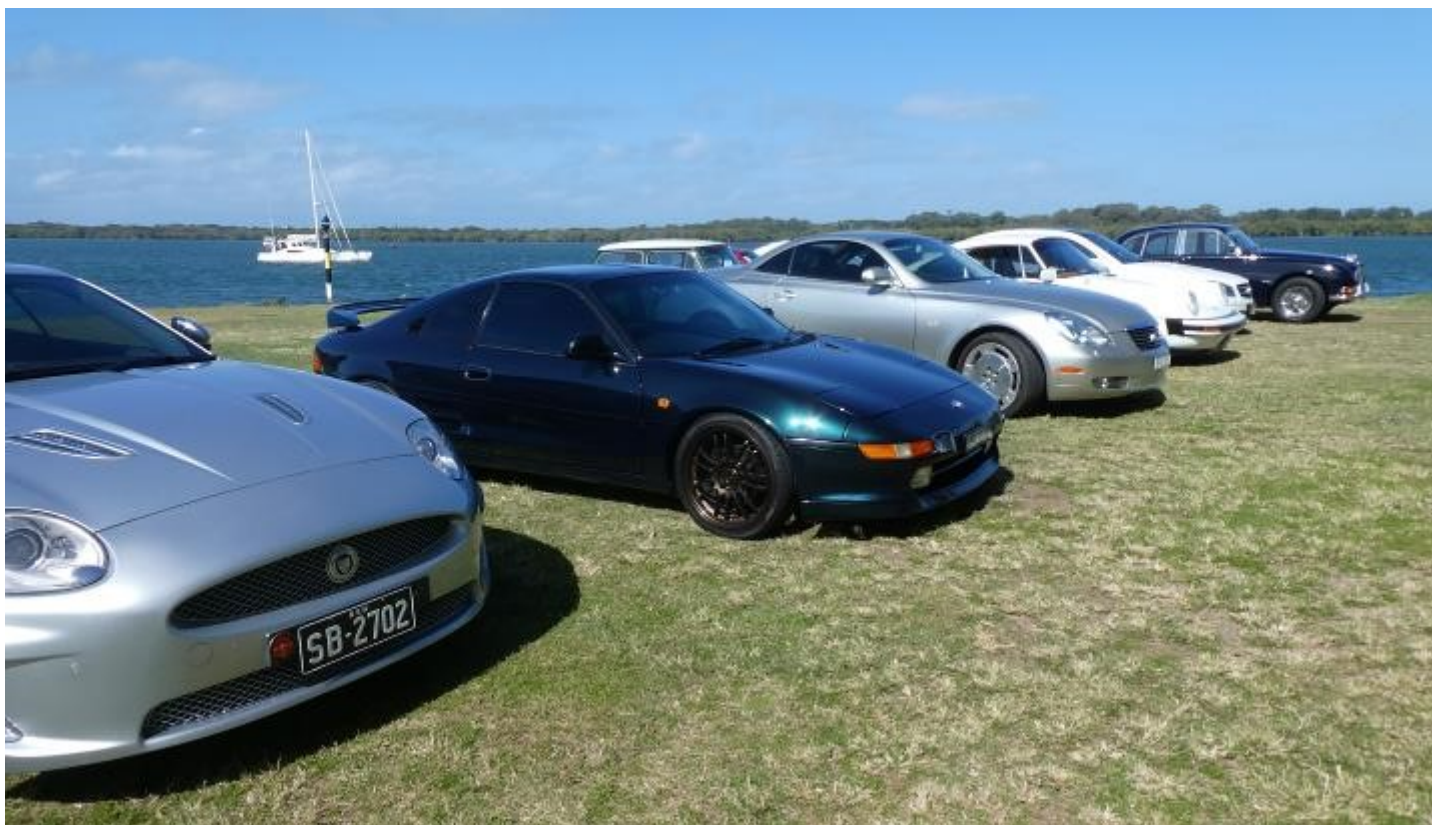
Club cars at the recent run to Mezze in Ballina

NEXT MEETING IS WEDNESDAY 7th JUNE—NOTE 7.00pm not 7.30pm