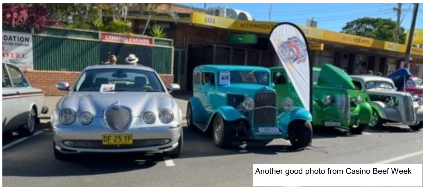
Another good photo from Casino Beef Week