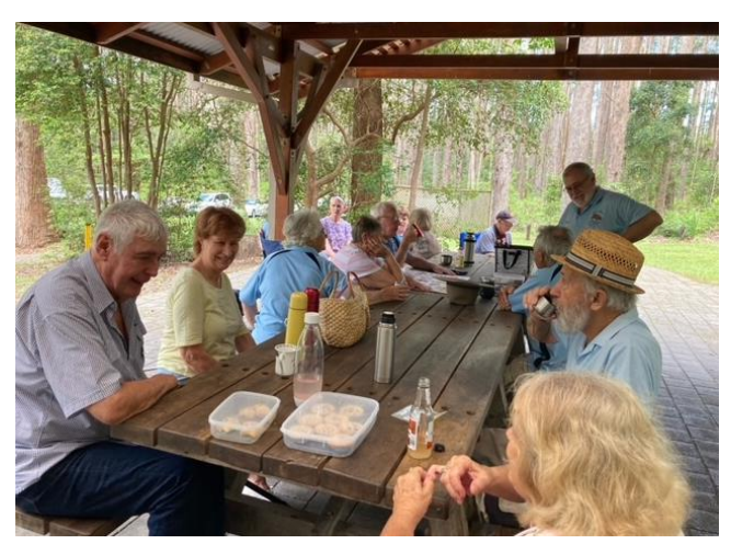
Above & below: The club was able to nab the main picnic shelter for the afternoon