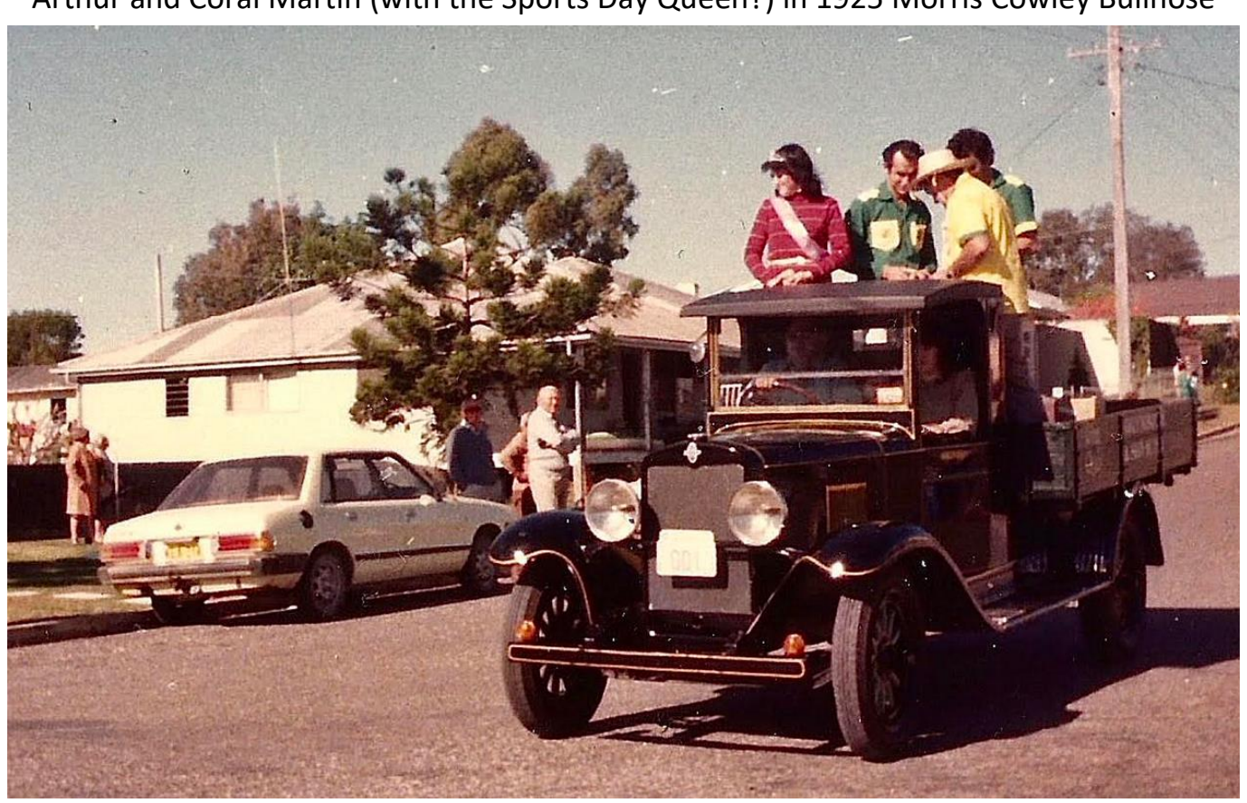
1929 Chev Truck – does anyone know who owned it?