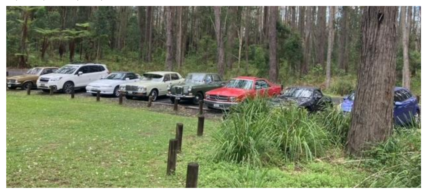
The line up of club vehicles looking particularly nice in the bushland setting of Bongil Bongil National Park.