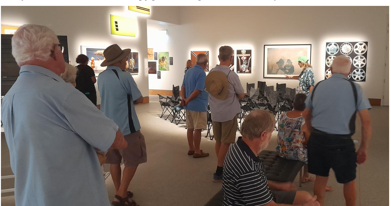
Every time you Editor loses a camp chair, they end up as part of an art installation like this one