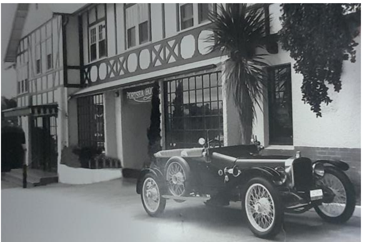
The fully restored Sunbeam in front of the famous Portsea Hotel on Victoria's Mornington Peninsula