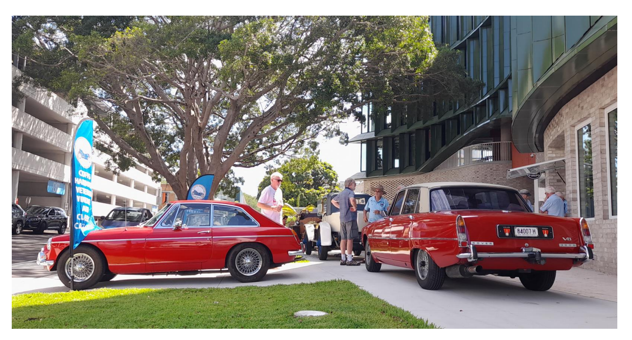
Pretty in red.....and doesn't the big fig tree look great as a backdrop?