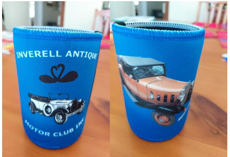
Both sides of stubby holder pictured