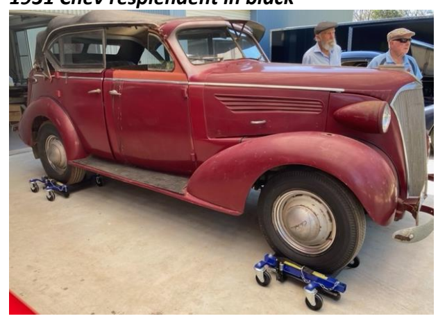
Rare 1937 4 door Chev convertible