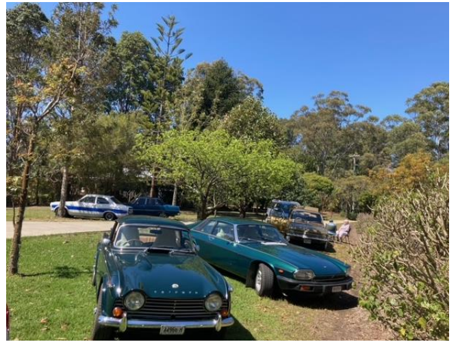
Club cars wait patiently while their owners check out the Diamond's collection