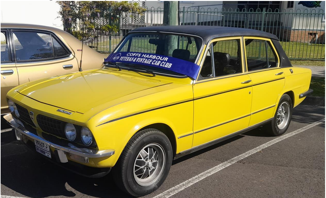
The Bojarski's banana coloured Dolomite caught the eye!