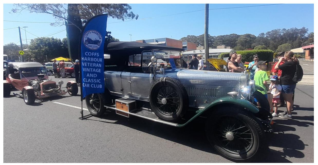
Graeme King's 1926 Star proudly flying the club banner