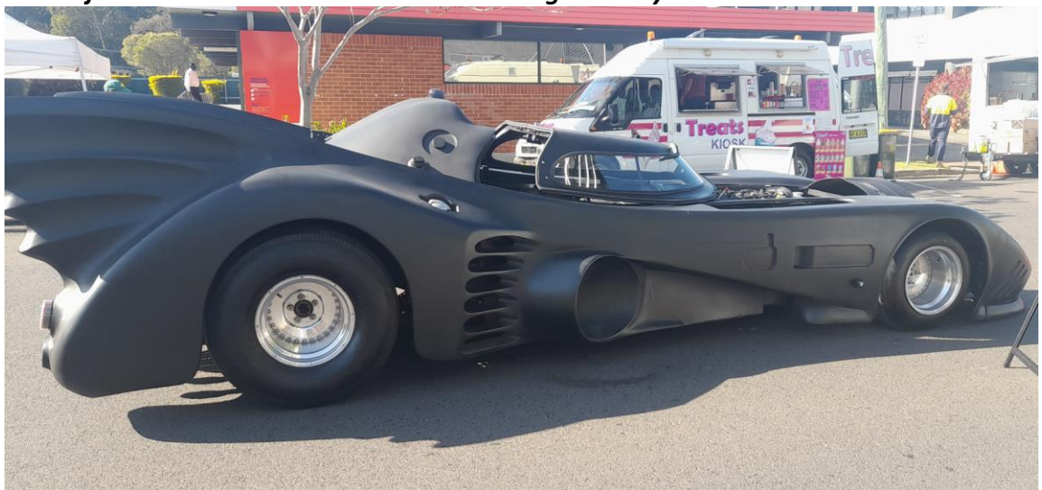
Even Batman dropped in for an ice cream and to check out the new centre!