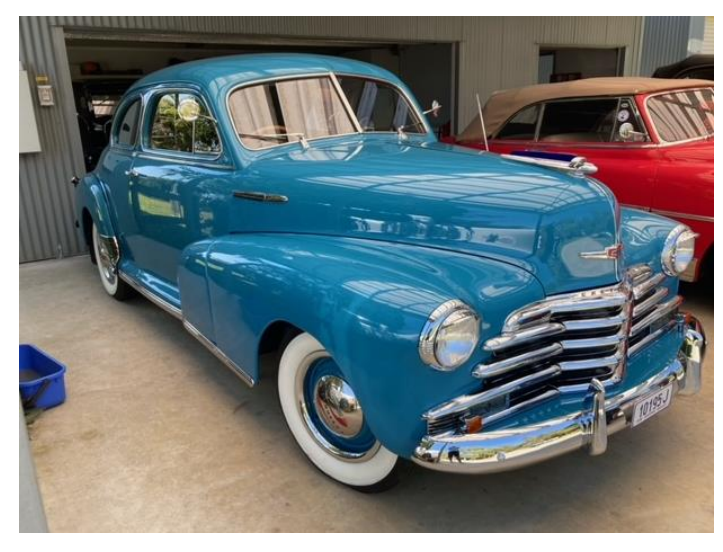
If you look up "Gorgeous" in the dictionary, you'll probably find a photo of this Chev!