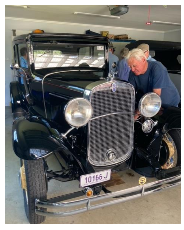
1931 Chev resplendent in black