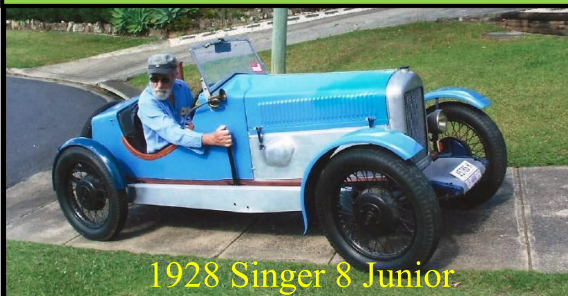
1928 Singer 8 Junior

Two of the cars which will be on display in the C.ex Coffs Club rear foyer from Sunday 1st October, leading up to the car show on 15th October