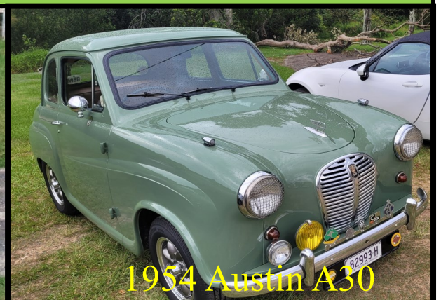
1954 Austin A30